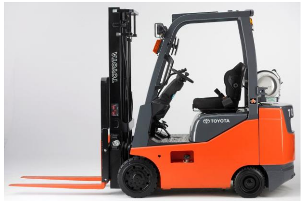
Photo may portray optional equipment not included in your quotation.

Mast 3-Stage (FSV) mast with full free lift. Mast specifications: Maximum Fork Height - 189" Overall Lowered Height - 83.1" (Overhead Guard Height - 80.10") Free Lift - 35.1" with standard Load Backrest