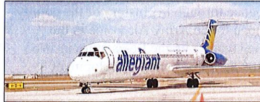
Allegiant Air has added three new routes in and out of Charlotte County: Grand Rapids, Michigan, Greensboro, North Carolina, and Lexington, Kentucky.